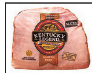
Kentucky Legend Double Smoked Ham