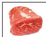
U.S.D.A. Choice Top Round Rump Roast