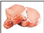
Center Cut Pork Chops