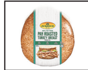
Eckrich Pan Roasted Turkey Breast