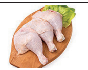
Fresh Chicken Leg Quarters