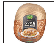
Jennie-O Oven Roasted Chicken Breast