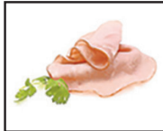
Warsaw Polish Ham Freshly Sliced