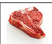
U.S.D.A. Gov. Inspected Porterhouse Steak