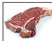
U.S.D.A. Gov. Inspected T-Bone Steak