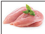
Fresh Hand Trimmed Boneless Skinless Chicken Breasts