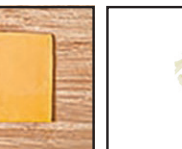
Di Nonna Whole Milk Mozzarella