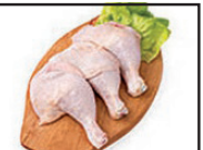
Fresh Chicken Drumsticks