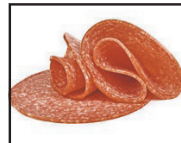
Primo Hard Salami