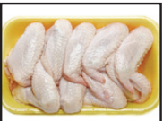
Fresh Chicken Party Wings