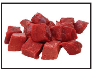
U.S.D.A. Choice Beef Kabobs