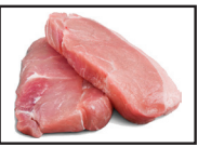
Boneless American Cut Pork Chops