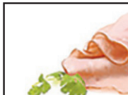
Krakus Honey Ham