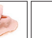
Kretschmar Oven Roasted Chicken Breast