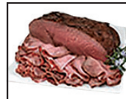
Angus Pride Roast Beef