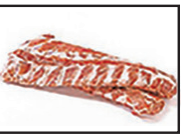
Fresh Lean Spare Ribs