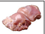
Fresh Boneless Skinless Chicken Thighs