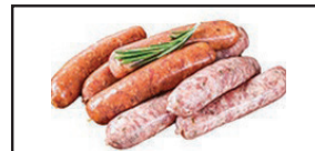
Fresh Angelo's Homemade Italian Sausage, Polish Sausage, Brats & Chorizo 2.99 LB

Boneless Thin Cut Pork Chops ..... 2.69 LB