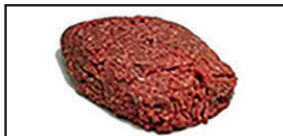
Fresh Lean Ground Round 2 Lbs. or More 5.49 LB